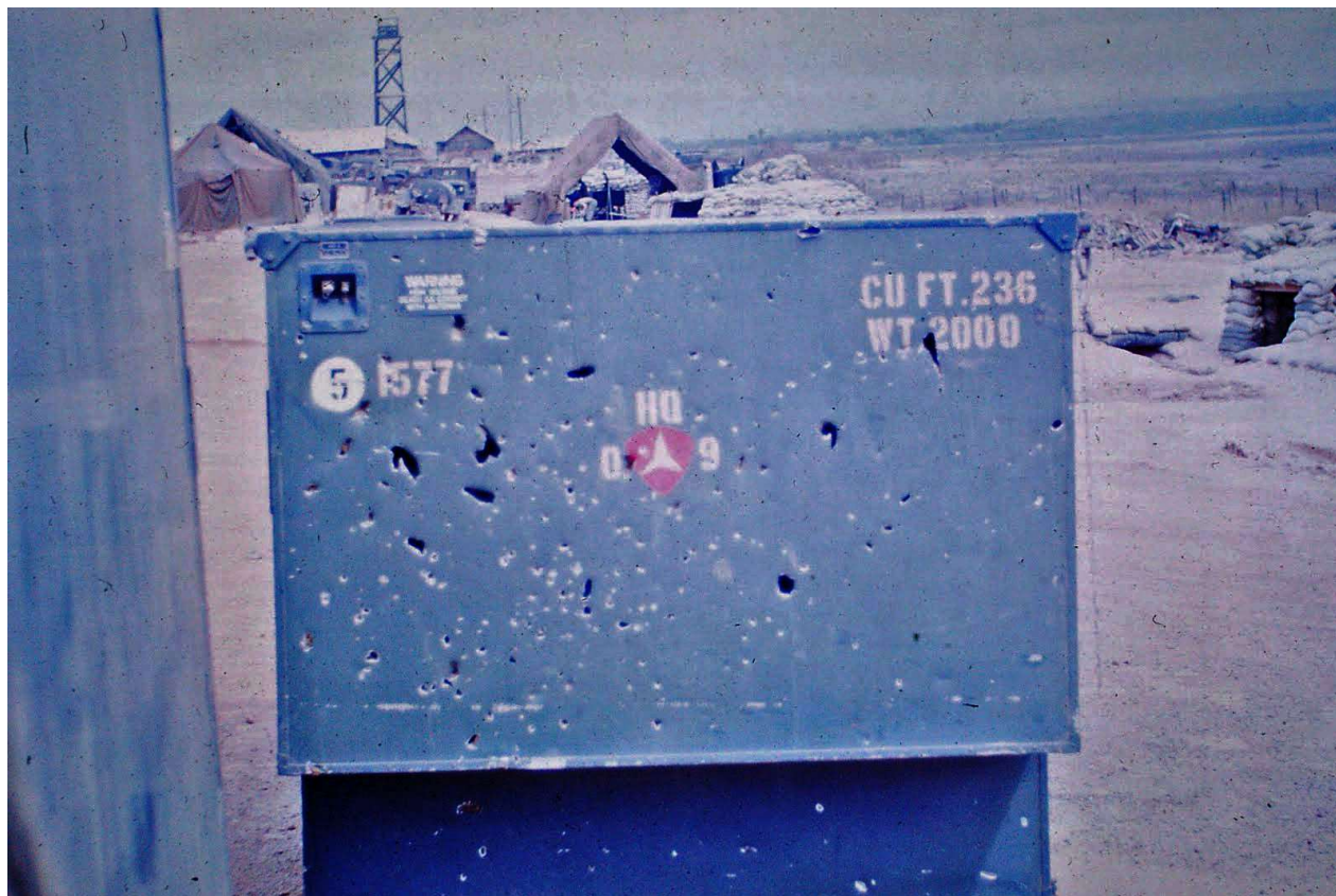
Radio Unit that was hit by shrapnel in Dong Ha in 1967