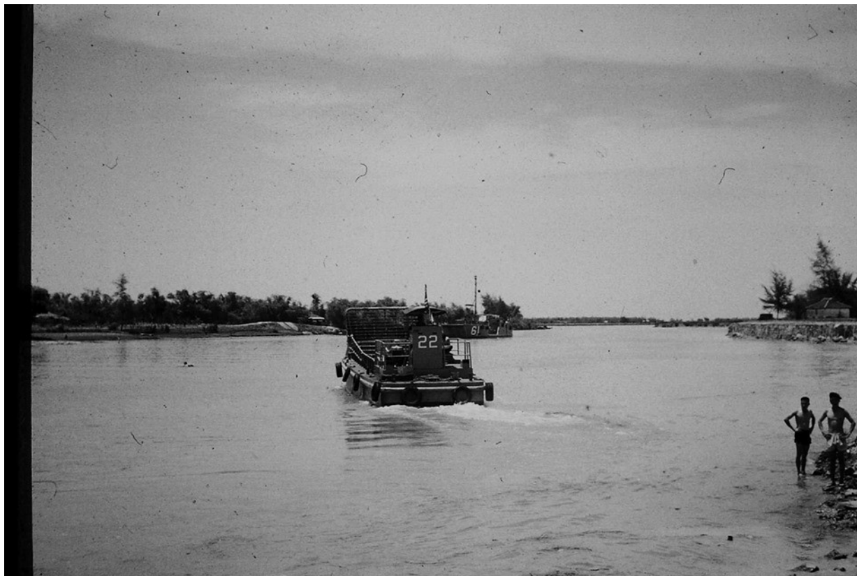
One of the boats heading back down the Chu Viet to the sea from Dong Ha Ramp in 1967