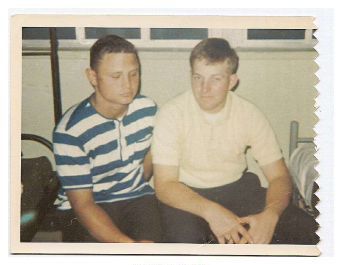
IN OKIE. 3-67 L-R THE MOUSE AND ME GETTING READY FOR B.C.ST. AND SOME FUN-----NEED MOUSE REAL NAME