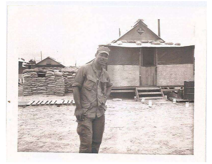
CLAY SUPPLY BIG DUDE LG FEET